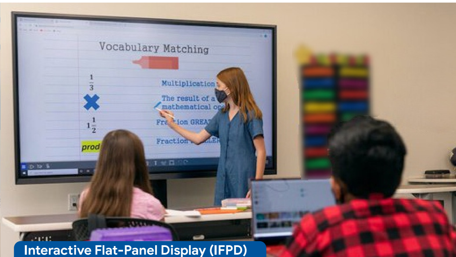
Interactive Flat-Panel Display (IFPD)

1. Advanced Technology: IFPs are equipped with a powerful inbuilt CPU (Central Processing Unit) T972A55*4/RAM-4GDDR/ROM-32G/ANDRIOD9.0, enables advanced processing capabilities. This processing power allows for smooth and seamless interactions with content and applications, making teaching and presentations more efficient.